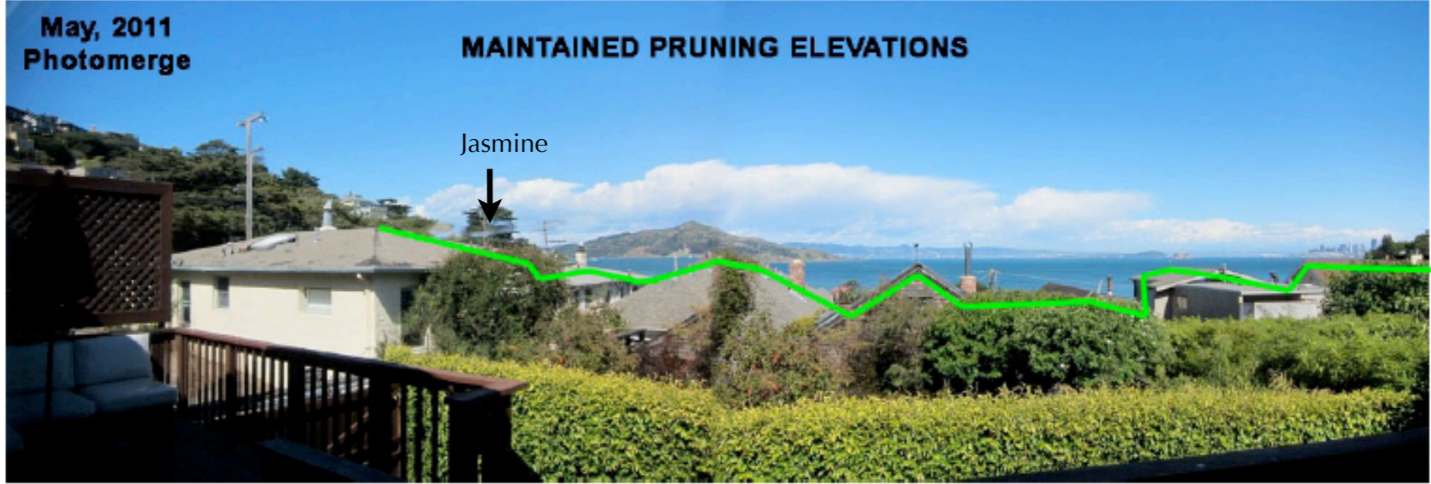
Hopseed Appear July 2012 Below roof line and window of brown house

ght should be below the roof lines and at a ees could be trimmend back to the and experience 3 or more feet of water ason.