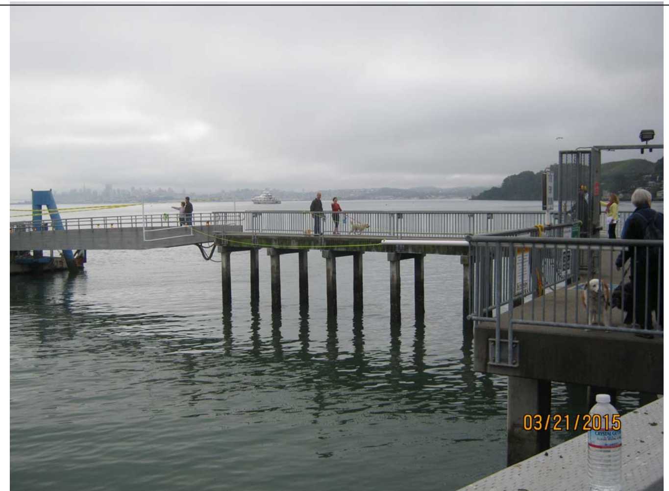
Staff photographs of Ferry Landing from SYC parking lot with story poles showing new access pier and gangway and "story buoys" showing the float