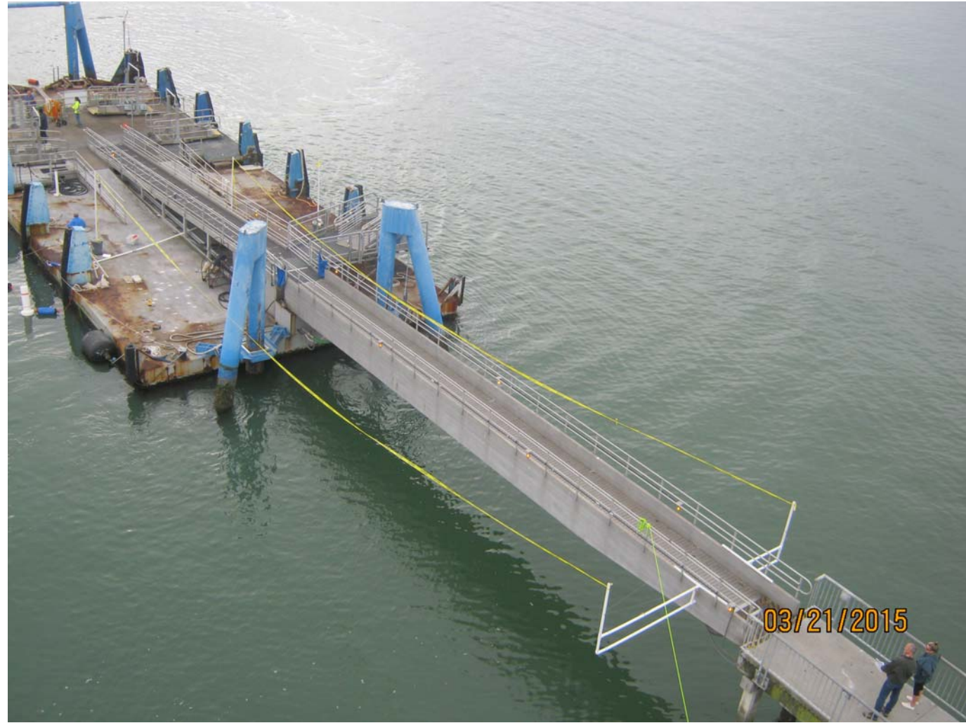
Staff photograph of Ferry Landing via Fire Dept ladder truck with story poles showing new gangway