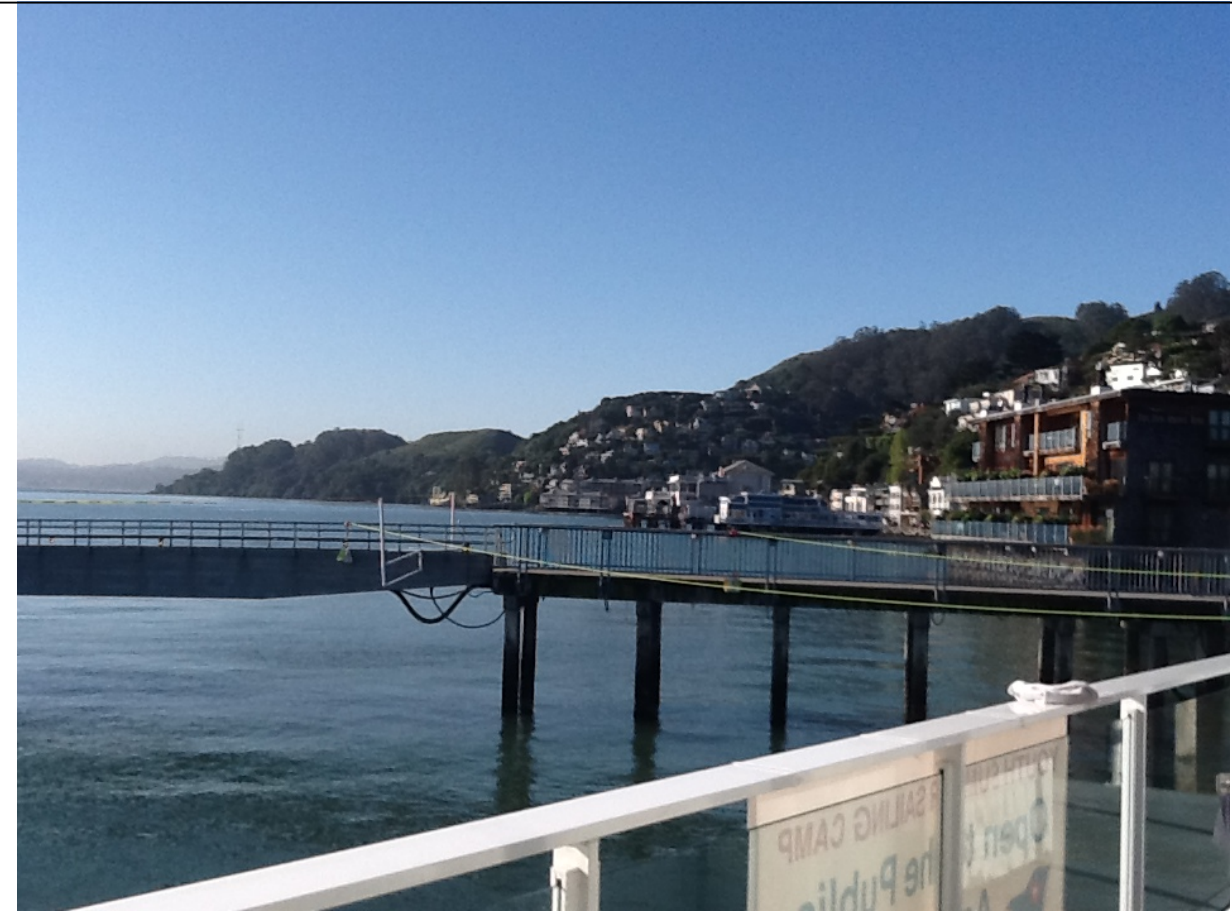
Staff photographs of view from middle of southeastern Sausalito Yacht Club (SYC) deck with story poles showing new access pier and gangway