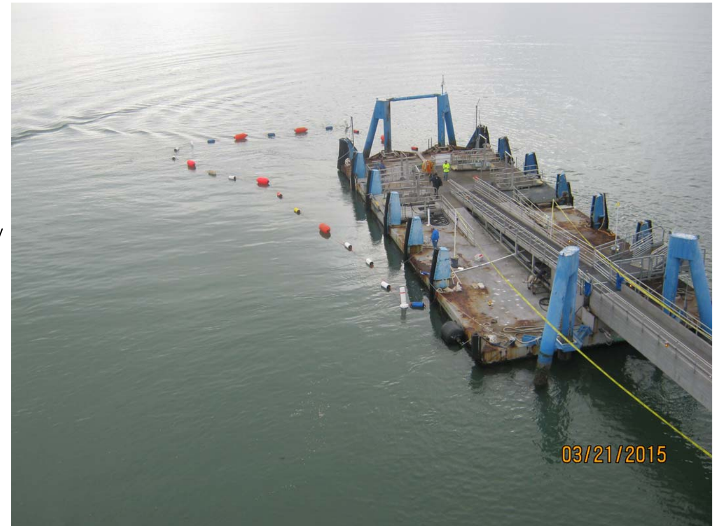
Staff photograph of Ferry Landing via Fire Dept ladder truck with story buoys" showing the float