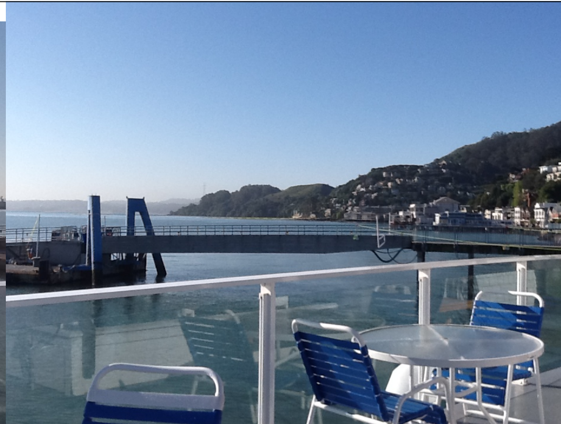
Staff photographs of view from corner of southeastern Sausalito Yacht Club (SYC) deck with story poles showing new access pier and gangway