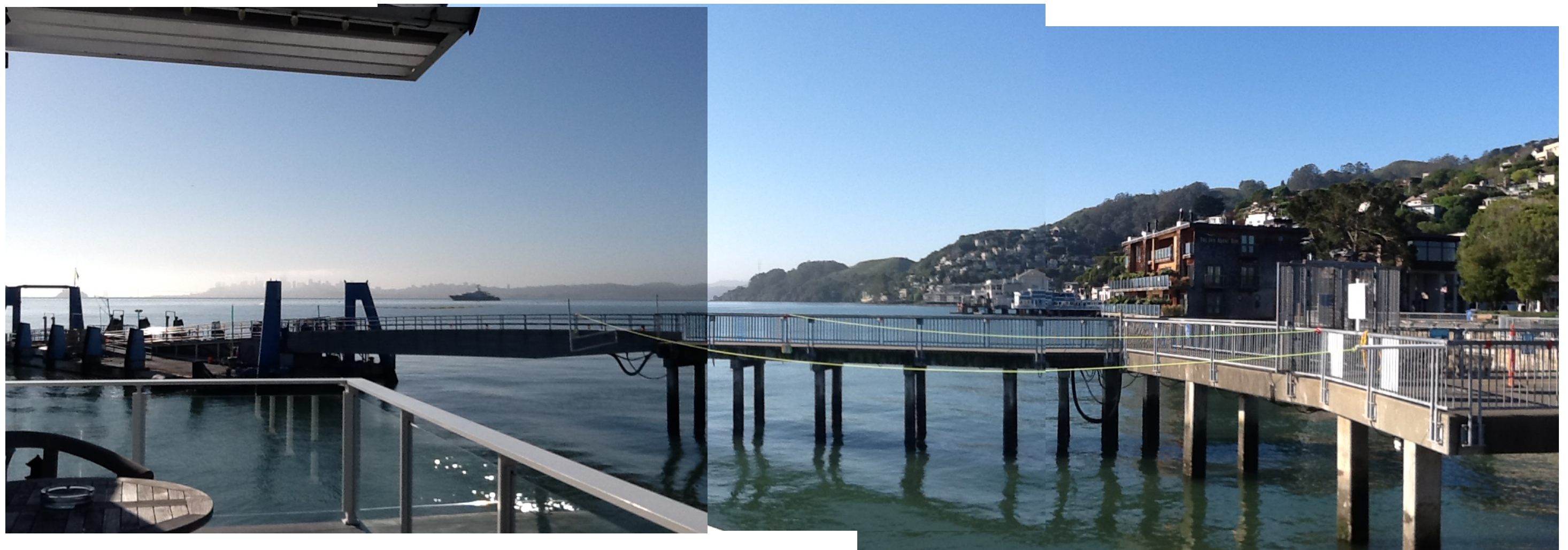
Staff photographs of view from southwestern Sausalito Yacht Club (SYC) deck with story poles showing new access pier and gangway