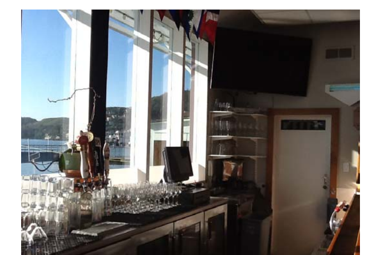
Staff photographs of view bar at Sausalito Yacht Club (SYC) with story poles showing new access pier and gangway