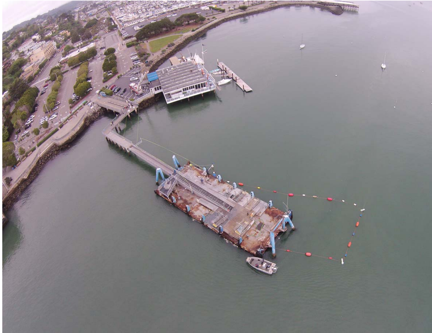
Photograph of Ferry Landing via drone showing story poles showing new access pier and gangway and “story buoys” showing the float