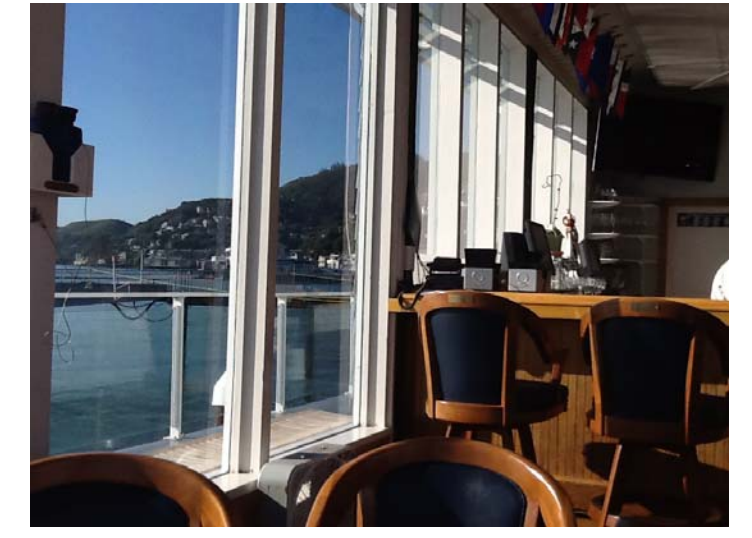
Staff photographs of view from tables in bar at Sausalito Yacht Club (SYC) with story poles showing new access pier and gangway