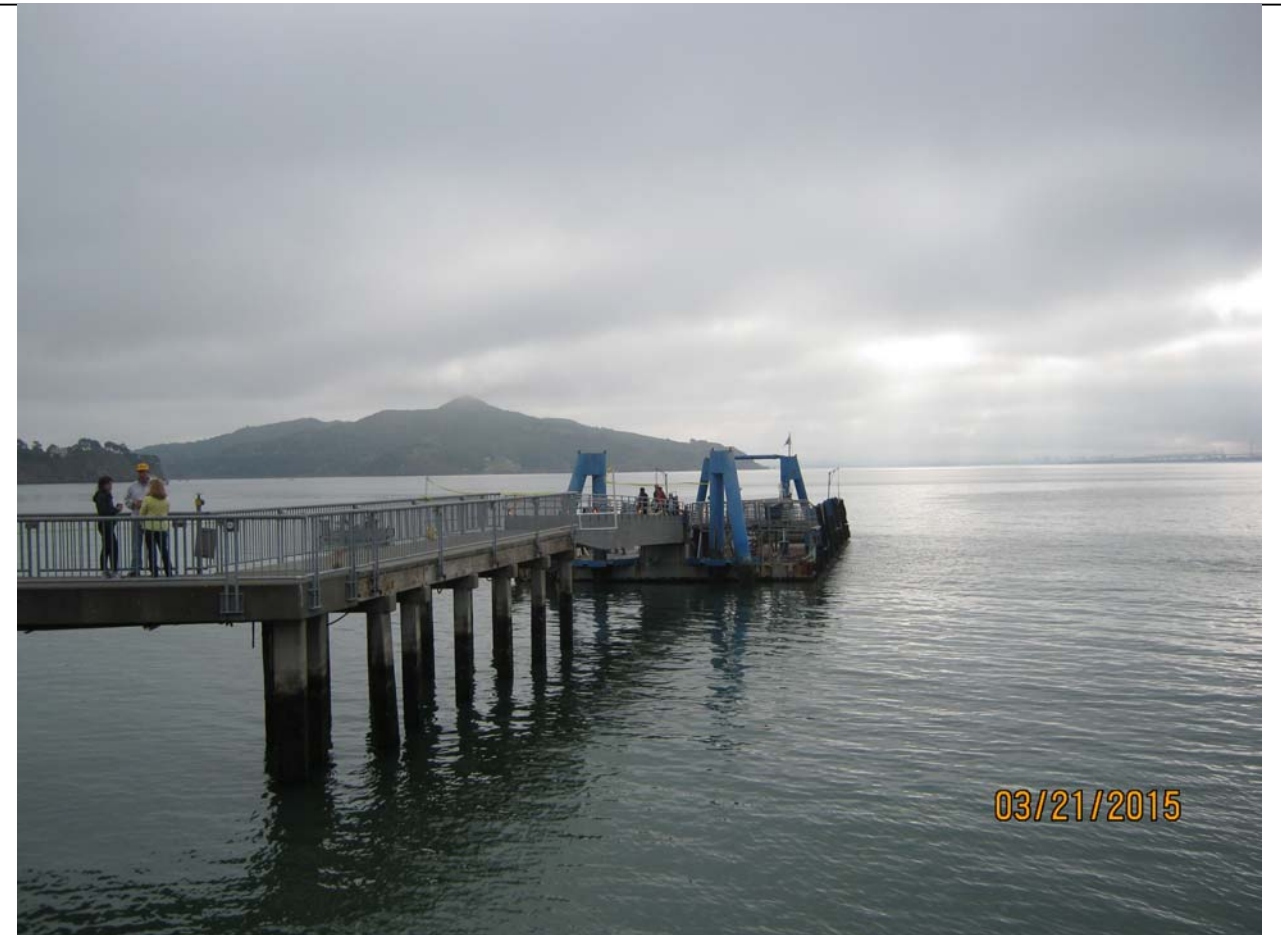
Staff photographs of Ferry Landing from plaza area with story poles showing new access pier and gangway and "story buoys" showing the float