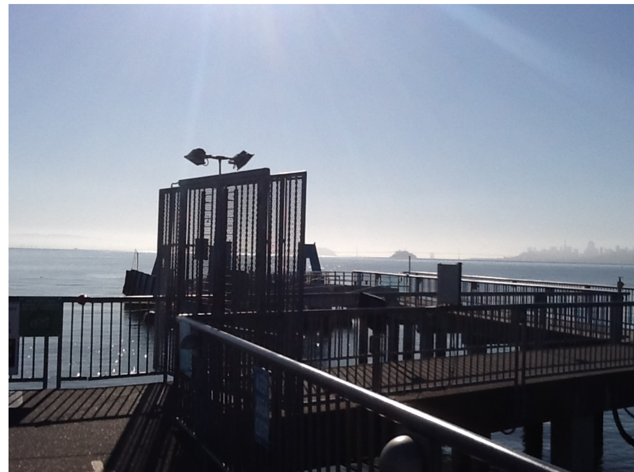
Staff photographs of Ferry Landing from end of existing access pier with story poles showing new access pier and gangway