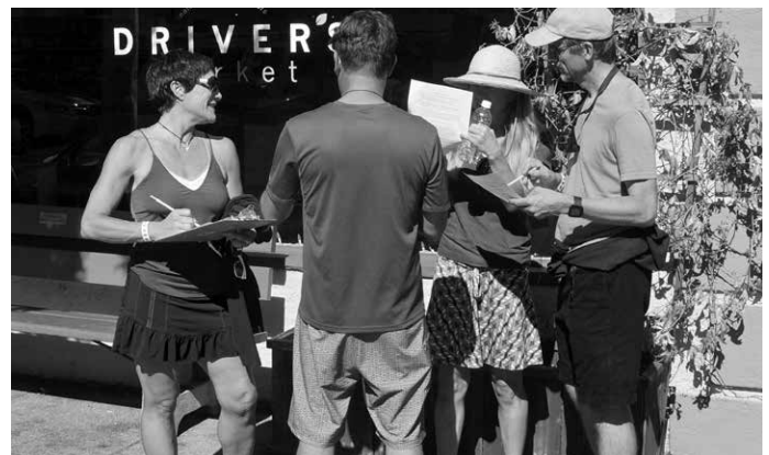
Teaming up to find the answer to the clues

The Treasure Hunt was held on a sunny October day and history sleuths enjoyed searching along Caledonia and Bridgeway for answers to the clues . Participants had to search for the answers to specific questions relating to buildings or items along the route.