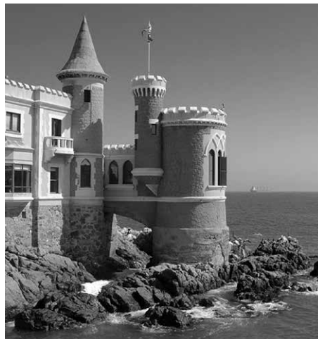
Wulff Castle, Viña del Mar