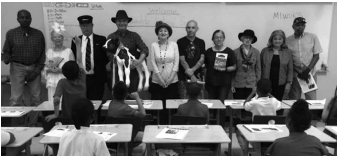
School Program docents presenting to Bayside/MLK third graders on the theme of historic people