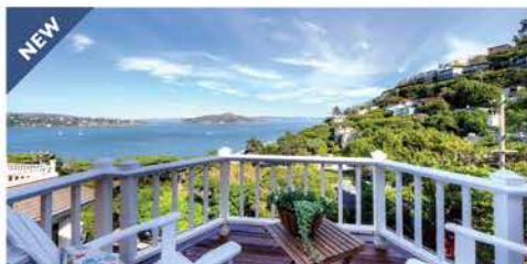
145 Edwards Avenue – $1,995,000 Beautiful Remodeled 3BR with Big Bay Views!