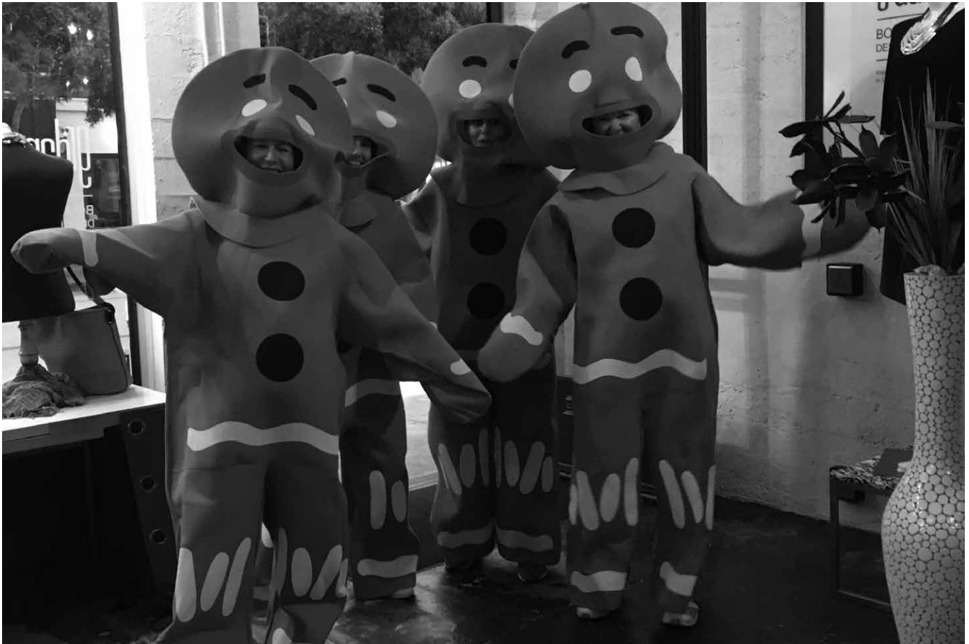
The fabled Gingerbread Men, shown here in a rare photo, will be appearing throughout Sausalito in December