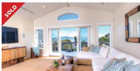
108 – 3rd Street – $2,075,000 Represented Seller