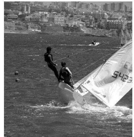
On the Racecourse