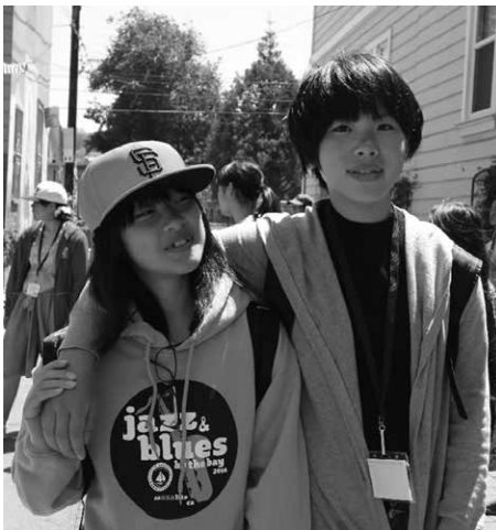
Delegates at Mission Mural Tour