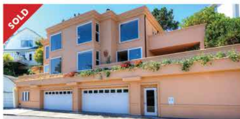
109-A Filbert Avenue – $1,275,000 Represented Seller