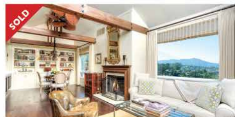
18 Kendell Court – $1,350,000 Represented Seller – Sold off Market