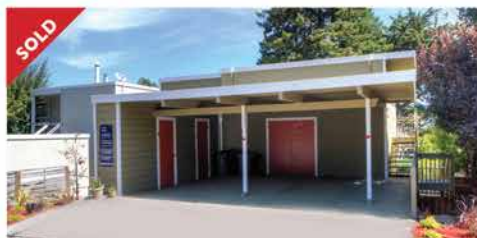
134-136 Buchanan Drive – $1,449,000 List Price Sold with Multiple Offers