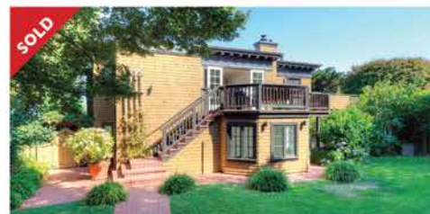
39 Cooper Lane – $3,195,000 Represented Buyer