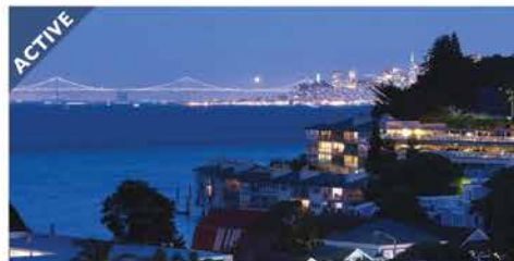
214 – 4th Street – $2,185,000 3BR/3BA with San Francisco Views!