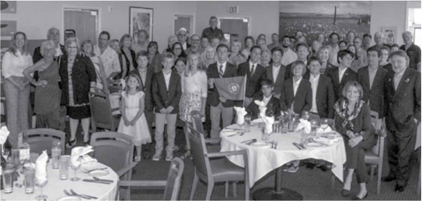
Youth sailors, host families, and Cascais sister city supporters gather at the SYC for the YSE awards banquet