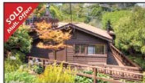
104-106 Glen Drive – $1,220,000 Charming Garden Duplex above Caledonia Street

Consistently one of the Top Real Estate Teams for Golden Gate Sotheby's International Realty.