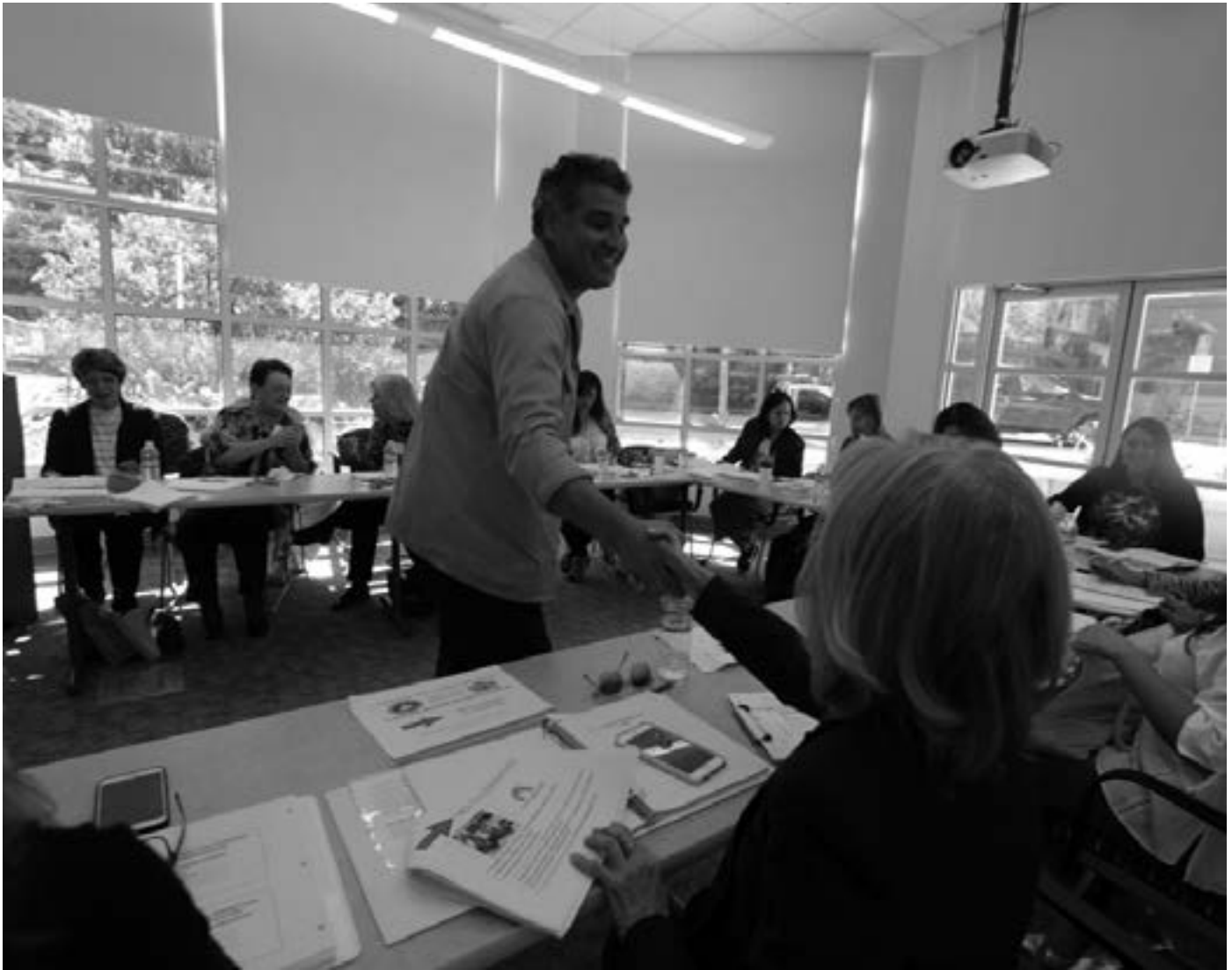
Businesswomen from Viña Del Mar attending a business workshop in Sausalito