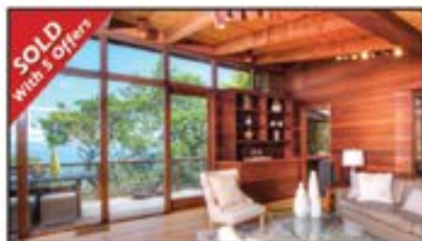
480 Sausalito Blvd – $1,525,000 2BD/1BA Exquisite Treehouse with Big Alcatraz & Bay Views & Garage!

Consistently one of the Top Real Estate Teams for Golden Gate Sotheby's International Realty.