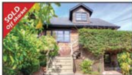
414 Richardson – $1,650,000 Classic Shingled Sausalito Cottage 3BD/3BA

Recently Recognized by REAL Trends as one of the "BEST REAL ESTATE AGENTS IN CALIFORNIA"