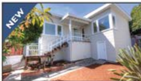
424-A Locust Avenue – $950,000 Sweet 2BD/1BA SFR with great Bay Views, Flat Yard just off Caledonia!