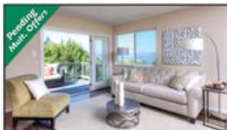
94-96 Glen Drive – $1,350,000 Great Investment Duplex w/Bay Views Both units are 2BD/1BA