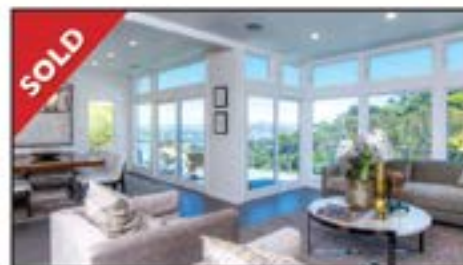
79 George Lane – $3,050,000 4BD Remodeled SFR with BIG Views & Legal, Fully Detached Unit!

Camara & Nadine are one of the few DIAMOND CERTIFIED agents in Marin!