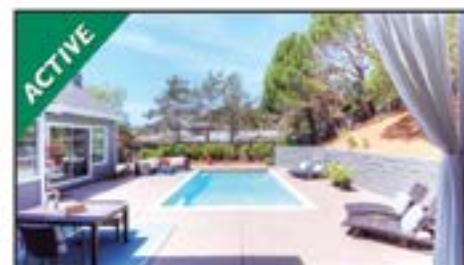
2 Turtle Rock Ct., Tiburon Ideal Family 5BR Home w/Pool and Flat Yard LIST PRICE $4,395,000

Consistently One of the Top Real Estate Teams in MARIN COUNTY!