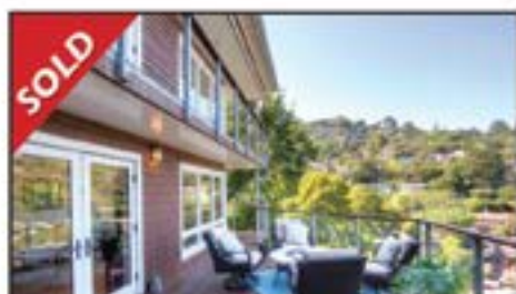
318 Sausalito Blvd., Sausalito Brand Newly Condo Converted 2BD/1BA w/Bay Views SOLD OVER ASKING for $1,010,000

Only Trust a Proven LOCAL Specialist with the Sale of Your Greatest Asset – Google our Zillow Reviews!