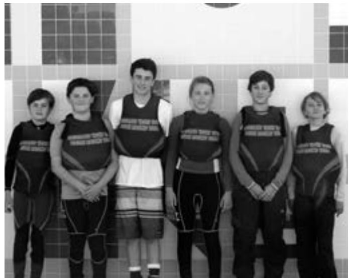
Student sailors in the YSE sailing exchange program

Sausalito welcomed two Calceteiros (artisans) from Portugal who were flown over by the City of Cascais to construct a beautiful Calcada pavement design with stones gifted to Sausalito by the City of Cascais; the compass rose mosaic is the centerpiece of the new Praca de Cascais in downtown Sausalito. Following the dedication ceremony in June with the Prime Minister of Portugal, the permanent landscaping will be installed. It's still not too late to donate to the project! You can have your business or family name embedded in a bronze plaque in the lovely new plaza in the center of town. For information: cheryl@poppinc.com