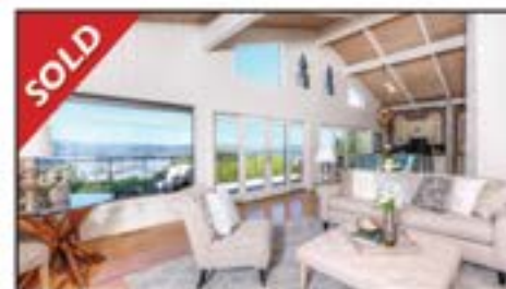
140 Currey Ave., Sausalito Coastal Contemporary 3BD/4BA w/Panoramic Views SOLD for $2,308,000

Only Trust a Proven LOCAL Specialist with the Sale of Your Greatest Asset – Google our Zillow Reviews!