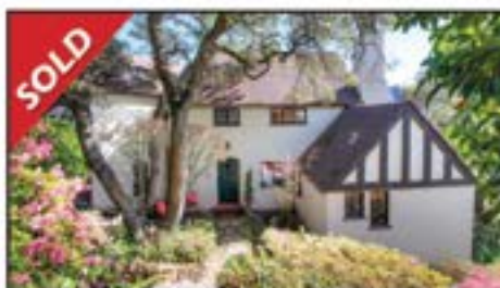
622 Sausalito Blvd., Sausalito Elegant 3BD/2.5BA Tudor in Banana Belt w/SF Views SOLD OVER ASKING for $3,000,000