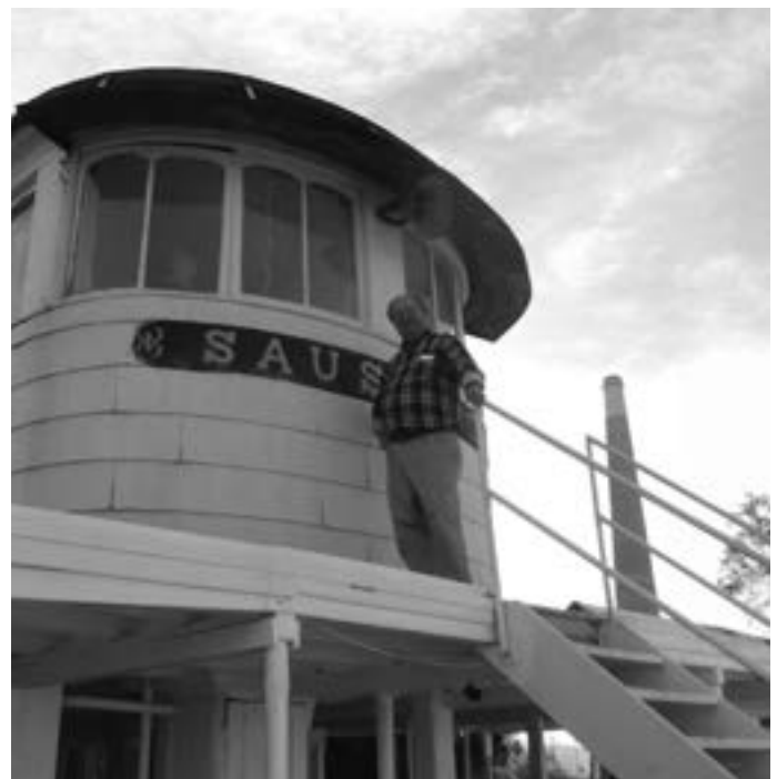
The Sausalito Ferry, currently serving as a clubhouse in Antioch

We’d love to have our City Hall Office and Exhibit open more often. If you or someone you know is interested in being a docent—helping people research our collections, please contact us at info@sausalitohistoricalsociety.com