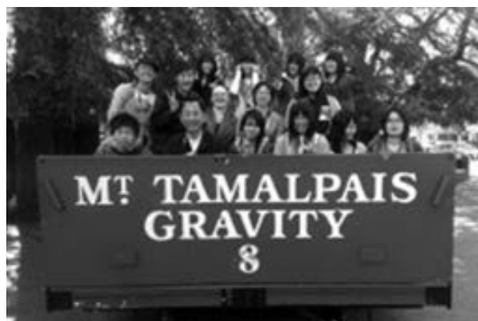
Sakaide delegates visit Mt. Tam