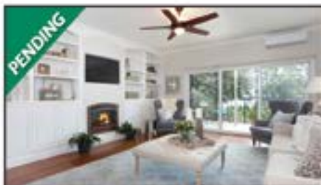
80 Lincoln Dr., #3A, Sausalito WaterView 2BD/2BA Marina Vista Condo PENDING OVER LIST PRICE OF $849,000