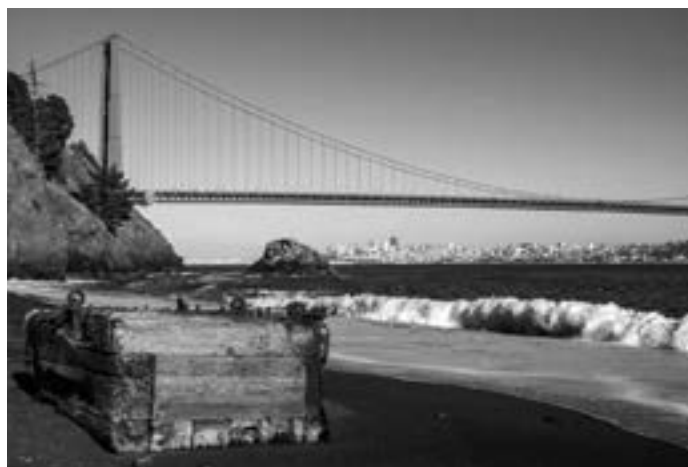
California National Park Kirby Cove

The SWC Scholarship Recognition Fund was established in 1956 by members of the SWC in order to provide financial support, encouragement and acknowledgement to deserving students seeking higher education who reside in Sausalito or Marin City. The Fund is supported by donations, proceeds of numerous fundraising activities and commemorative and memorial gifts. Over the past 60 years, the program has awarded in excess of $1,000,000 in local scholarships. The SWCSRF, a 501(c)(3) non-profit organization, is governed by a 12-member Board of Directors made up of SWC members. For more information, visit http://swcsrf.org .