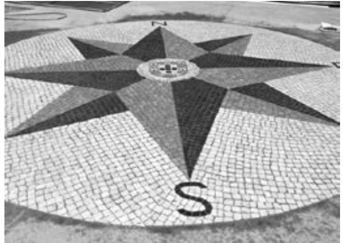
Downtown Sausalito's newly-created Calcada

Sausalito welcomed two Calceteiros (artisans) from Portugal who were flown over by the City of Cascais to construct a beautiful Calcada pavement design with stones gifted to Sausalito by the City of Cascais; the compass rose mosaic is the centerpiece of the new Praca de Cascais in downtown Sausalito. Following the dedication ceremony in June with the Prime Minister of Portugal, the permanent landscaping will be installed. It's still not too late to donate to the project! You can have your business or family name embedded in a bronze plaque in the lovely new plaza in the center of town. For information: cheryl@poppinc.com