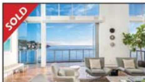
2070 Paradise Dr., Tiburon Luxurious Waterfront New Construction 4BD/3.5BA Represented Buyer – SOLD for $6,250,000

Recently Recognized by REAL Trends as Two of the "BEST REAL ESTATE AGENTS IN CALIFORNIA"