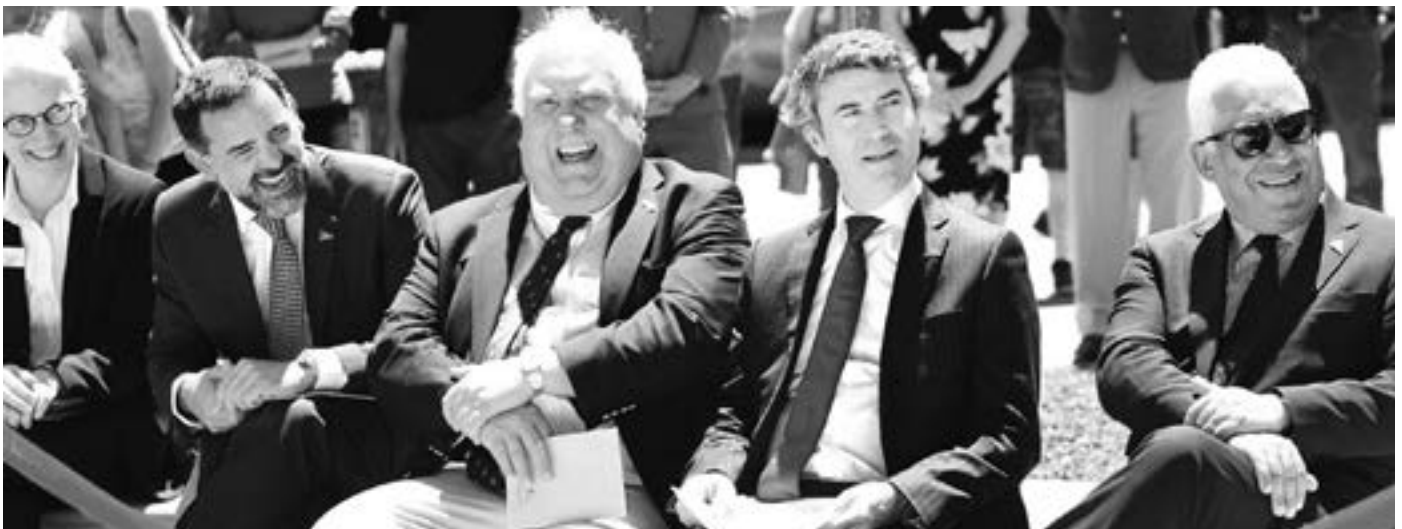
Cascais dedication ceremony

Thanks for everyone who supported our Food Booth at Jazz & Blues by the Bay in late August! The sun shone, the beer was cold, and the Portuguese sausage sandwiches were a hit! It was a benefit for our youth sailing exchange and our youth sailing parents pitched in and made it all happen!