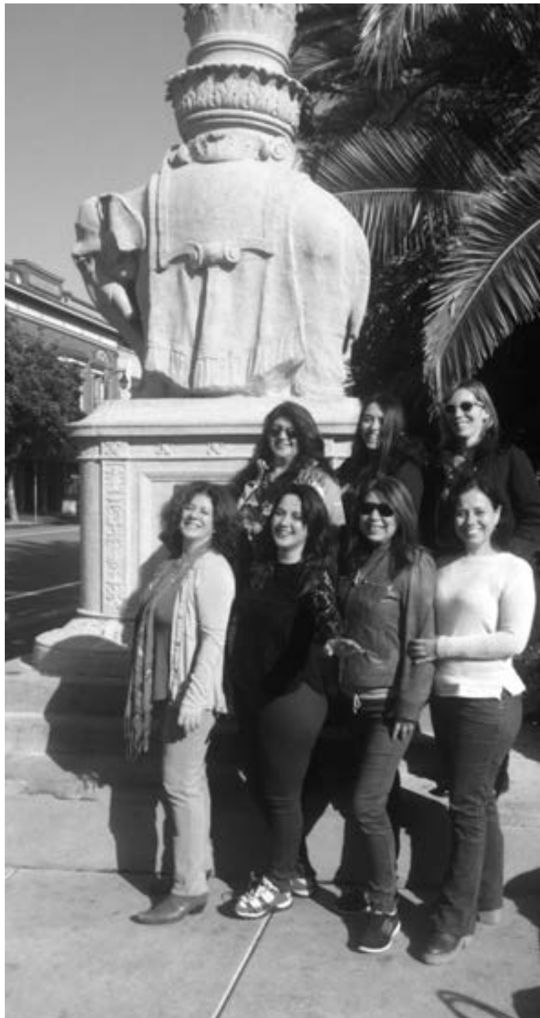
AGEP business owners visit Sausalito

The AGEP women will be traveling to Sausalito in 2019 and we will be planning another week of education and introduction to our Sausalito and Marin County business community. We hope you will share in meeting these women and enhancing their experience in our city.