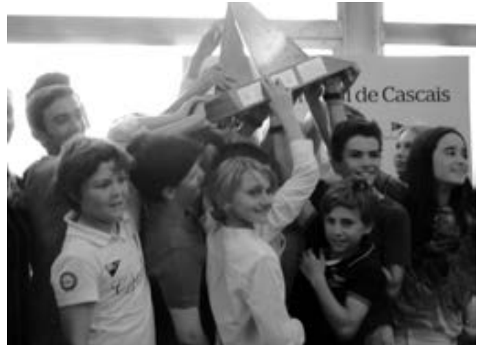
Sausalito sailors celebrate their victory!