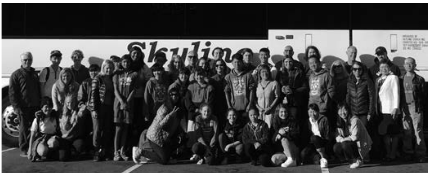
The Japanese students, their host families, and the chaperones on the final morning of this year's Sister Cities Program

Next Summer, we will return to Sakaide with a fresh group of curious young minds. If you are a bright, respectful, and curious high school student, perhaps you'll find yourself among us. To find out more about getting involved, please visit our website: SausalitoSisterCities.org .