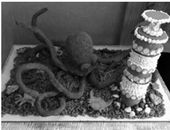
The Inn Above Tide