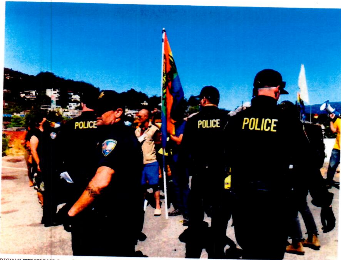
RISING TENSIONS Sausalito police officers help to clear a homeless encampment in June.