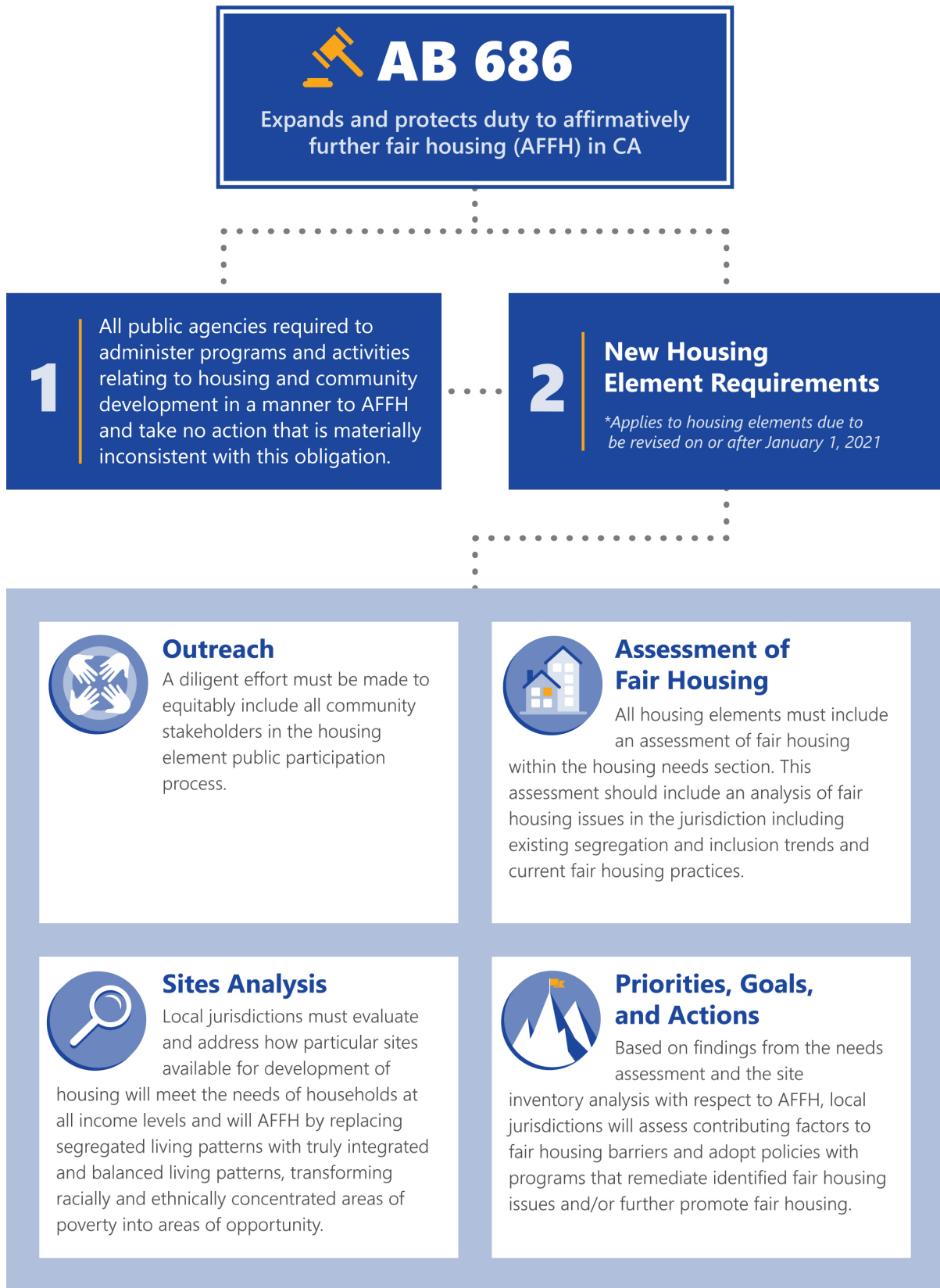
Chart 1: Summary of AB 686 Requirements