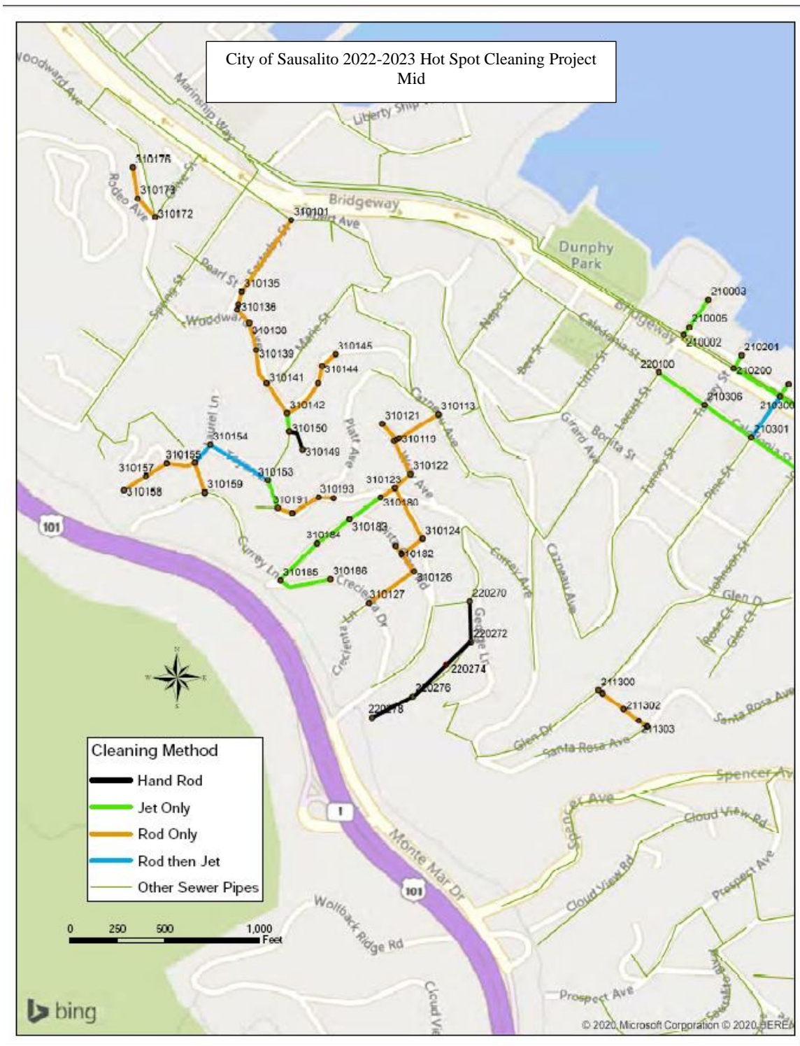
Figure 1 Page 3 of 4