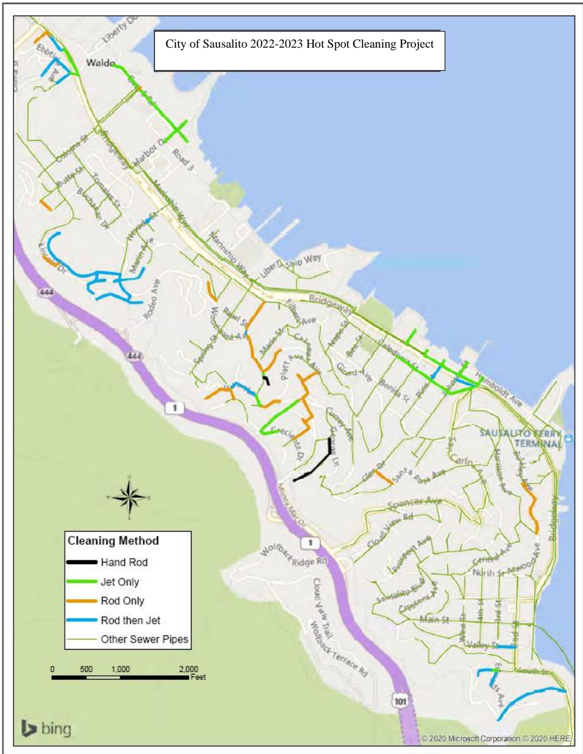
Figure 1 Page 1 of 4