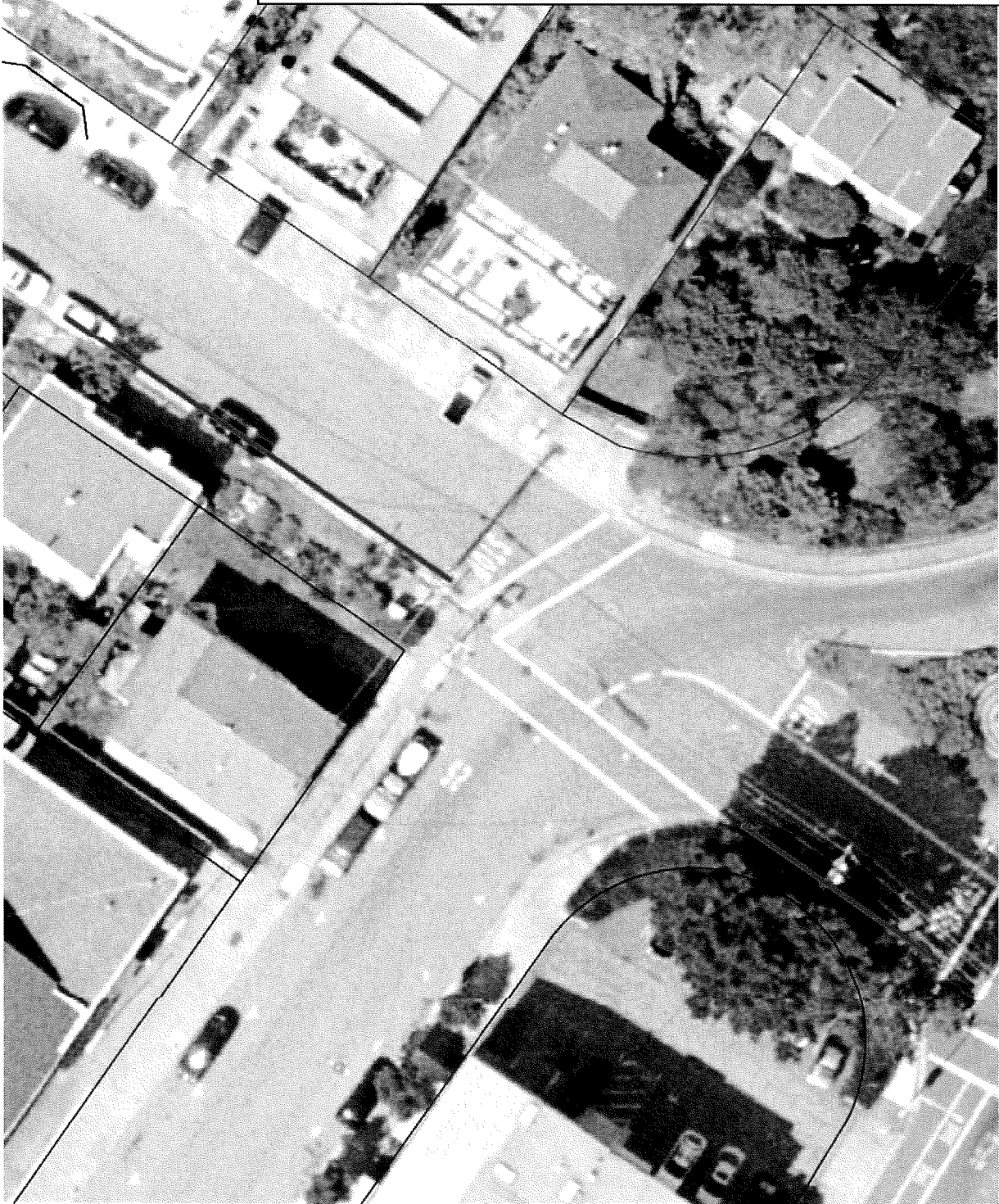
Napa Street between West Edge of C-R and Bridgeway (Existing)